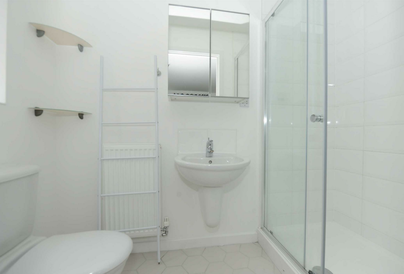
Bedroom 5 Bathroom